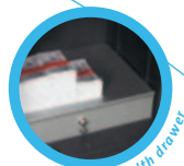
full width drawer