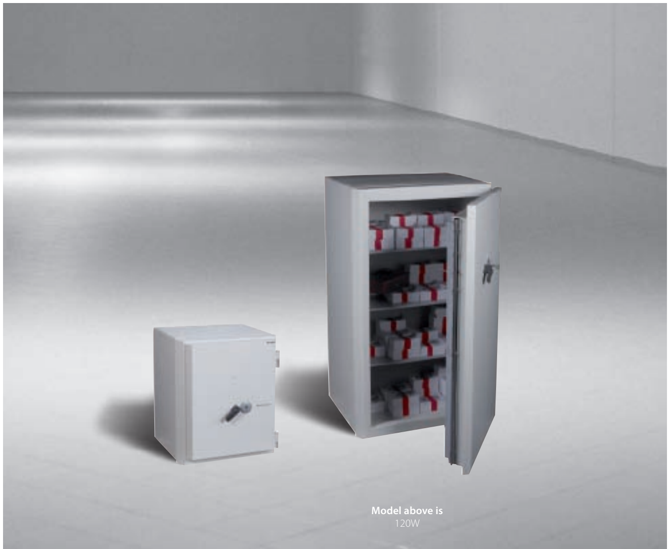
Model above is 120W