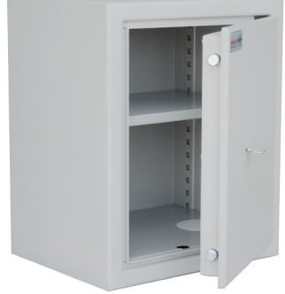
SC110 Key or Electronic