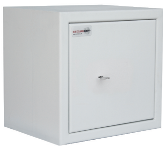
SCo5o Key or Electronic