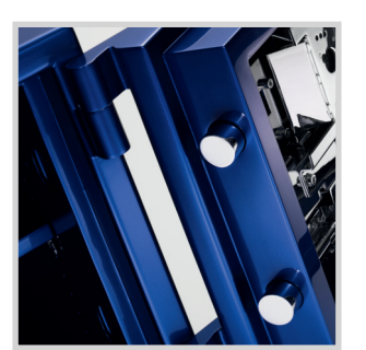
Bespoke RAL colours available on all grades and sizes