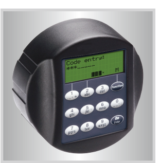
Auditable Electronic Lock Option