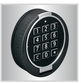
Electronic Locking Option