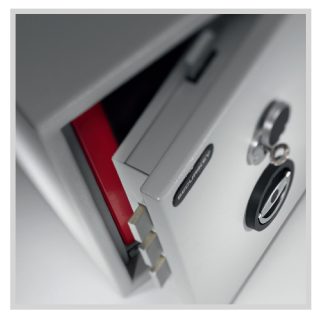
3-Way Locking Bolts

MULTIPLE LOCKING OPTIONS AVAILABLE – SEE PAGE 5 • DEPOSIT OPTIONS AVAILABLE – SEE PAGE 26